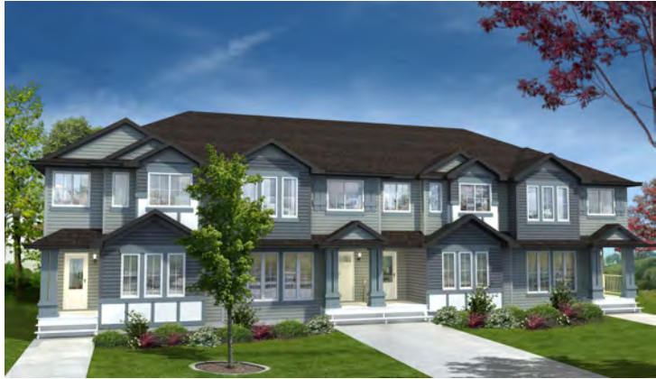
Colour Scheme 2